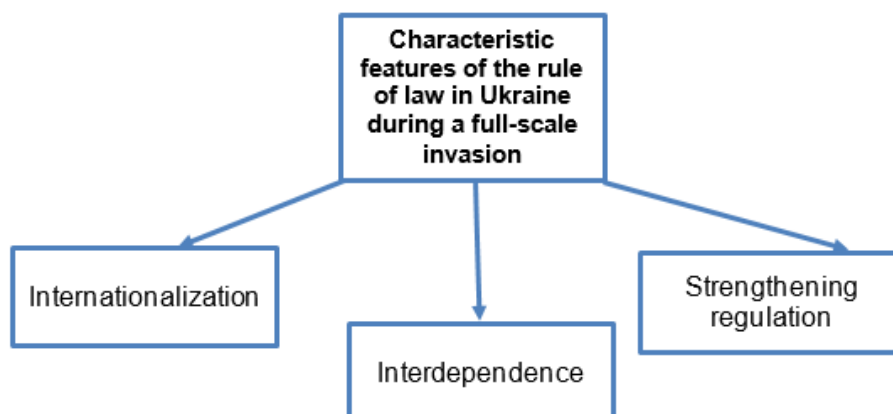
Figure 1. Characteristics of the rule of law in Ukraine during a full-scale invasion